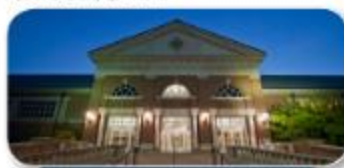
Homer Health & Recreation Center